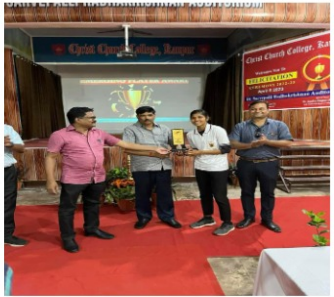
Felicitation of Students