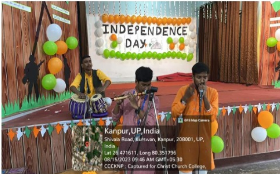
Instrumental Jugalbandi on Independence Day