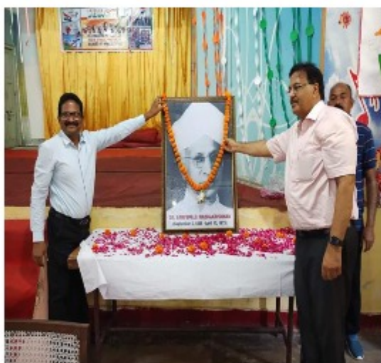
Garlanding of Photo of Dr. Sarvepalli Radhakrishnan

The College Auditorium was renamed Dr. Sarvepalli Radhakrishnan Auditorium to commemorate his visit to the College on 7 th January 1961.