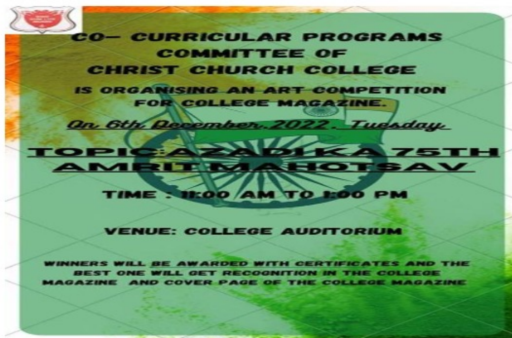
Flyer of Art Competition

The students were very enthusiastic about the event , as they were assured that the best ones would feature in the College magazine , along with the names of the winners.