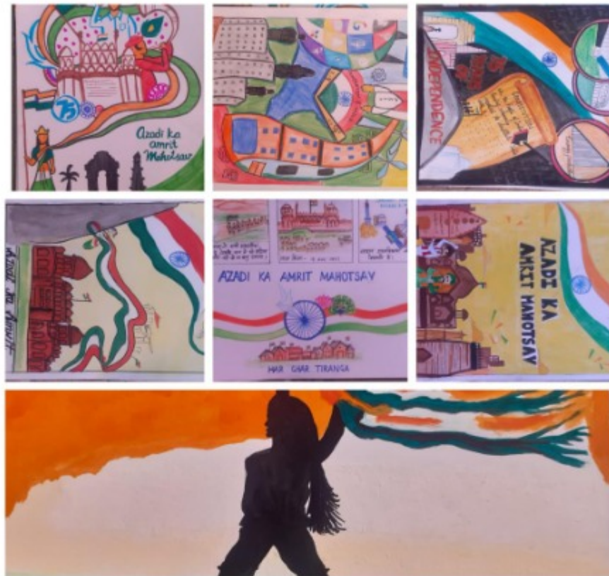
Collage of Winners entries