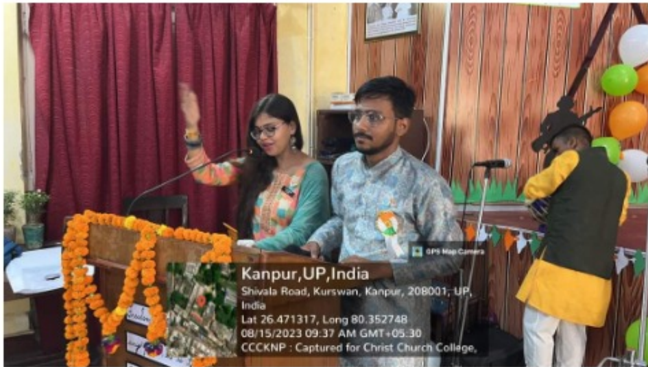
Anchors of the Independence Day Program