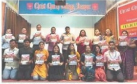
The Christ Church College organised a felicitation ceremony