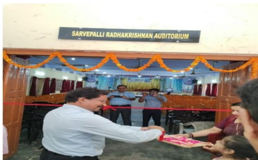
Auditorium named after Dr. Sarvepalli Radhakrishnan