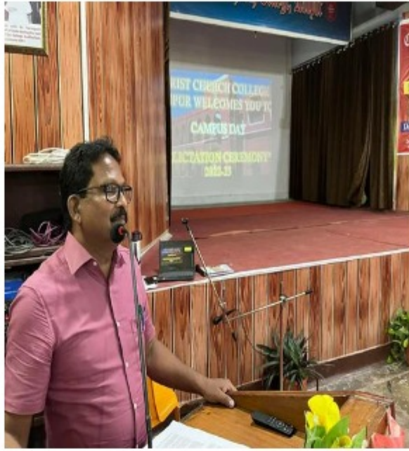
Principal's Address on Felicitation Ceremony