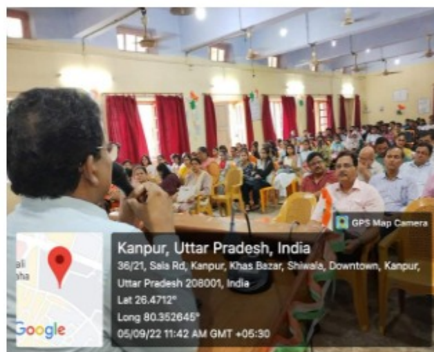
Principal's Address on 5 th September 2022