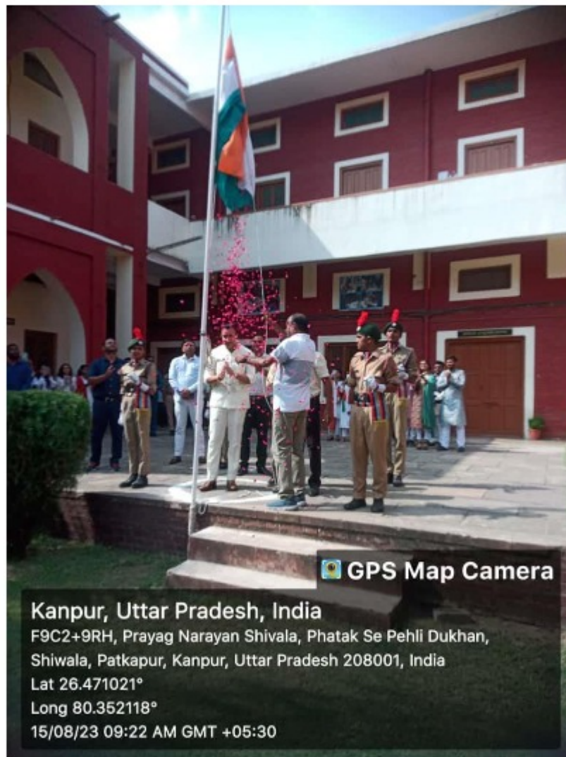
Flag Hoisting on 15.8.2023

Students took part in singing songs, instrumental jugalbandi and reciting poems based on the spirit of patriotism and love for our motherland.