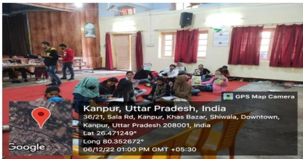
Art Competition in progress

The results of the Art Competition are as follows :