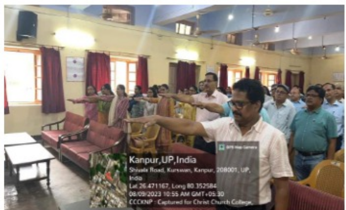
“ Panch Pran “ oath being administered and taking the “ Panch Pran “ oath