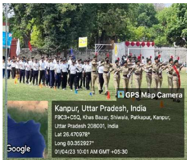
MARCH PAST OF NCC CADETS AND PLAYERS

Given below are some snapshots of the various activities of Annual Sports Meet 2022-23 of Christ Church College, Kanpur.