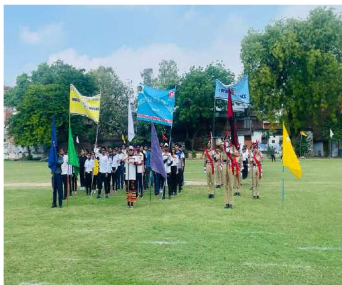
RANGER ROVERS, NSS AND NCC CADETS