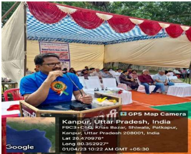
ADDRESS TO THE STUDENTS BY PRINCIPAL