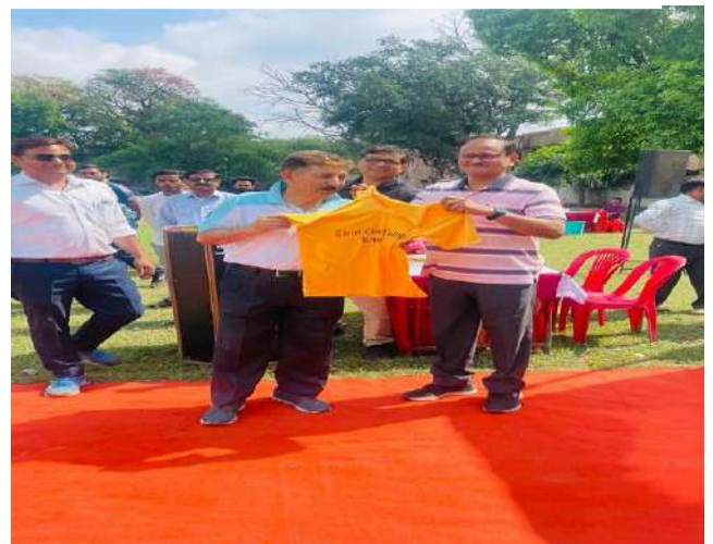
T-SHIRT DISTRIBUTION TO OFFICIALS AND STUDENT REPRESENTATIVES