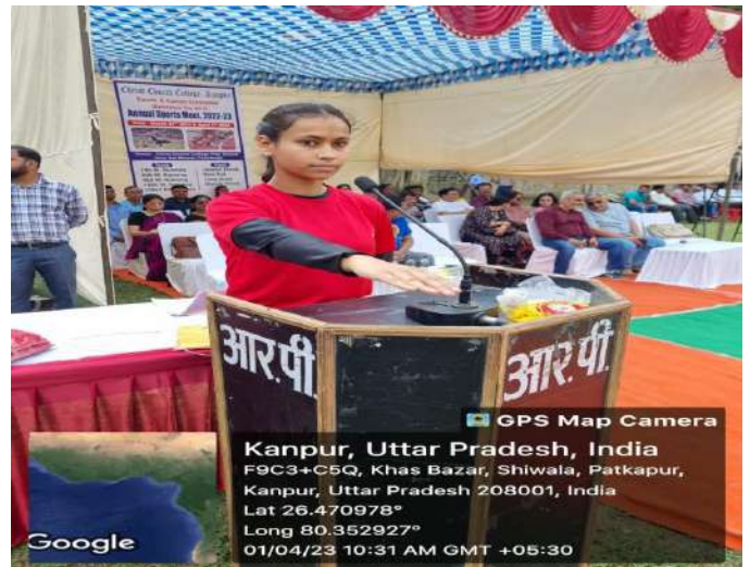
OATH TAKING CEREMONY