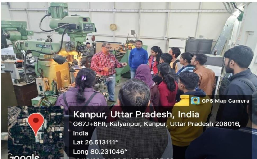
Central Workshop milling machine