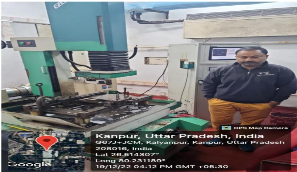
DECKLE MAHO Milling Machine (Above) and EZEECUT NXG demonstration (below)