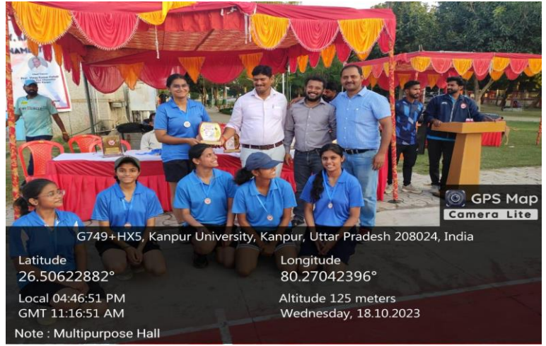
GPS Map Camera Lite G749+HX5, Kanpur University, Kanpur, Uttar Pradesh 208024, India Latitude 26.50622882° Longitude 80.27042396° Local 04:46:51 PM Altitude 125 meters GMT 11:16:51 AM Wednesday, 18.10.2023 Note : Multipurpose Hall