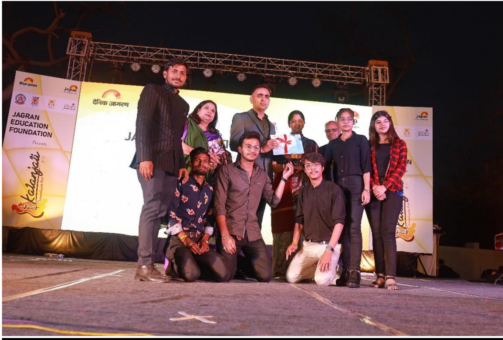
Mime Team(2 nd Prize)