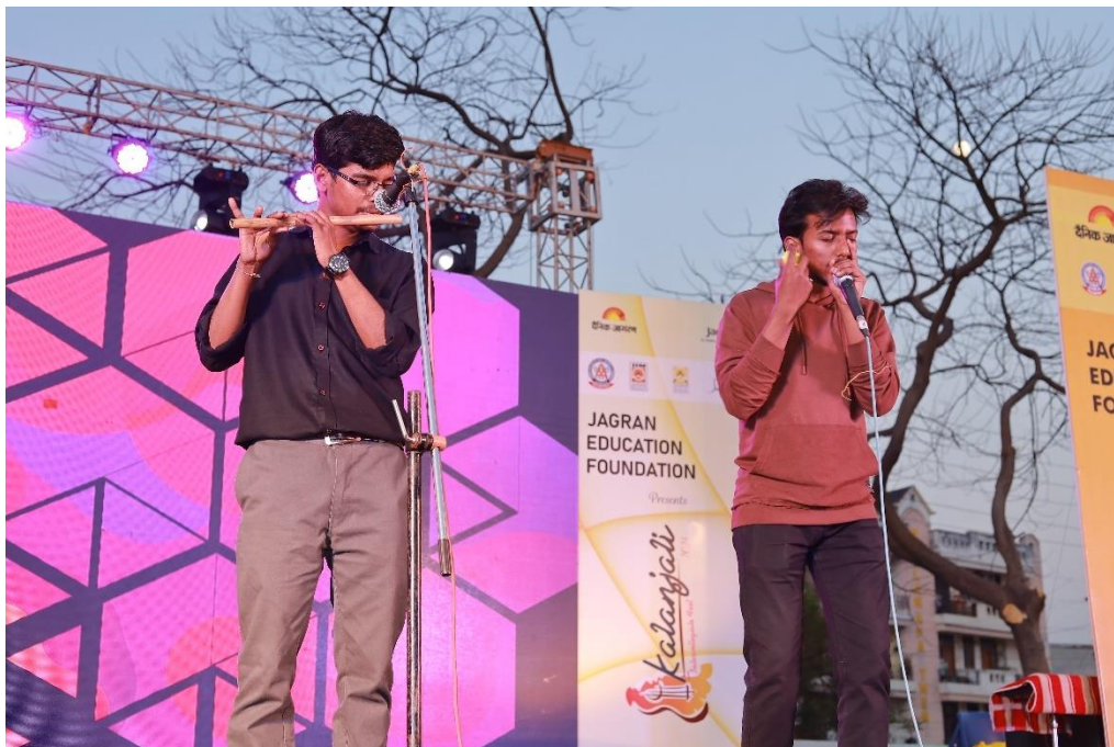
Western Vocal Team (2 nd prize)