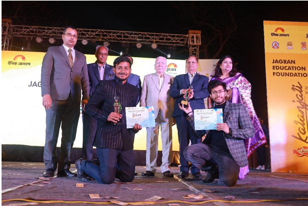
Quiz Team( 3 rd Prize)