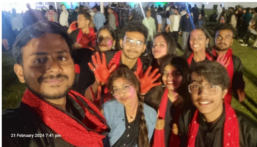
Dance Drama Act