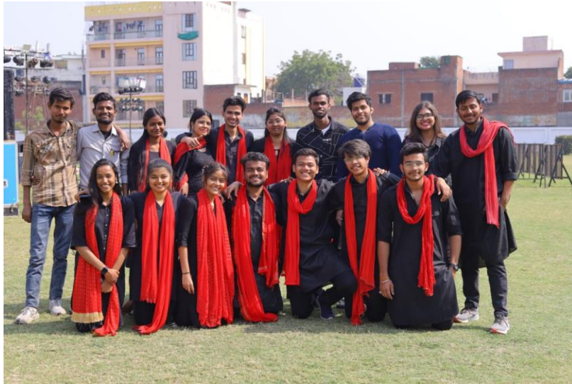
Nukkad Natak Team